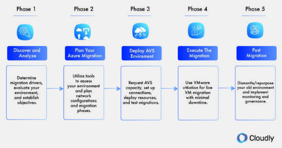
Fig.1. VMs to Azure Migration Process

Backup-based Migration, using Cloudly's expert team, enables direct cross-platform restores of VMware backups to Azure without needing new tools. Developing a clear VMware-to-Azure migration plan that outlines steps, timelines, and responsibilities is crucial for aligning stakeholders with the objectives and expected outcomes.